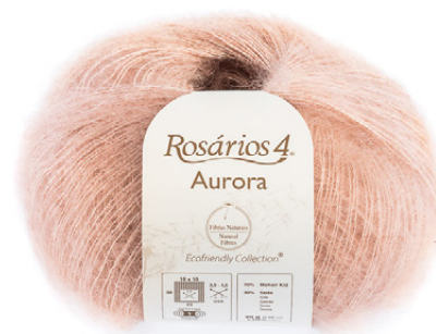
AURORA Colour 07 (70% mohair kid, 30% silk)